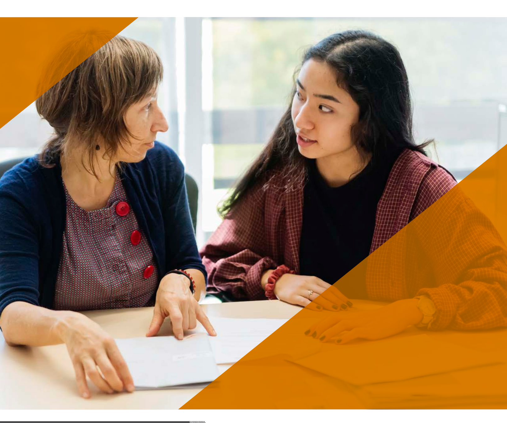
STUDENT SERVICES AND SUPPORT