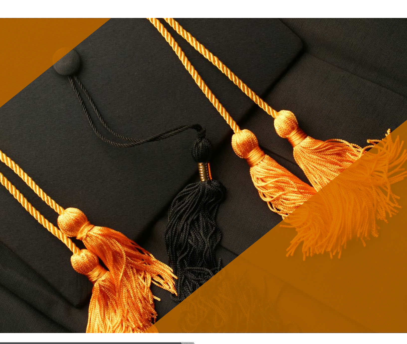
CERTIFICATES AND DEGREES